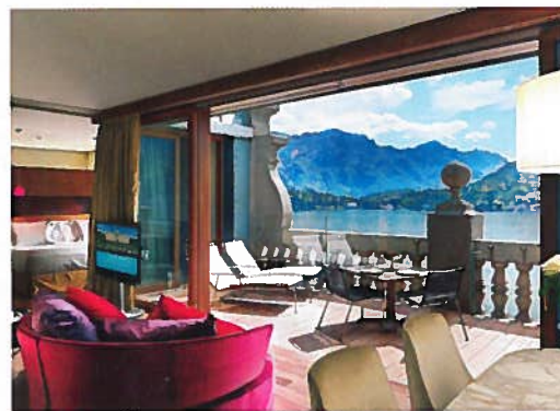
Clockwise from top: Grand Hotel Tremezzo's Front Suite terrace and living room and a Corner Suite. Below: Karl Lagerfeld and pool art for the Hôtel Métropole Monte-Carlo.