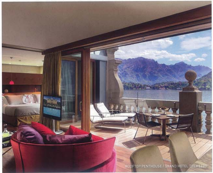
ROOFTOP PENTHOUSE / GRAND HOTEL TREMEZZO