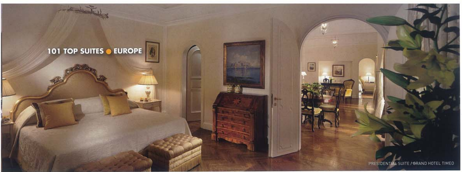
PRESIDENTIAL SUITE / GRAND HOTEL TIMEO