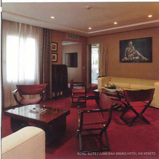
ROYAL SUITE / JUMEIRAH GRAND HOTEL VIA VENETO