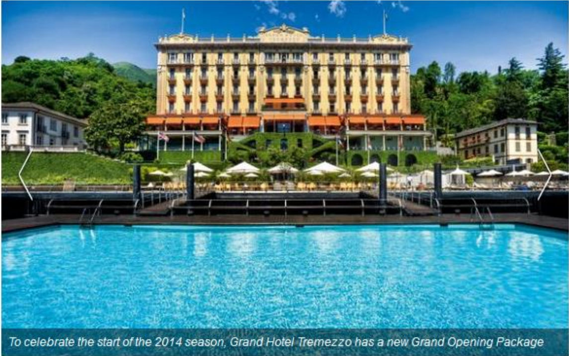
To celebrate the start of the 2014 season, Grand Hotel Tremezzo has a new Grand Opening Package