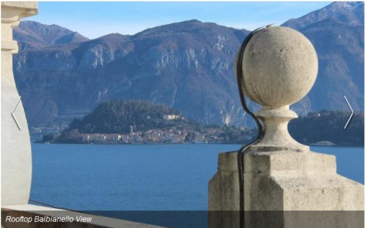
Rooftop Balbianello View